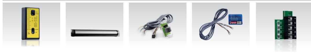
Spotfinder Rain Accessory Fire Door Adapter Multisensor hub Retrofit interface